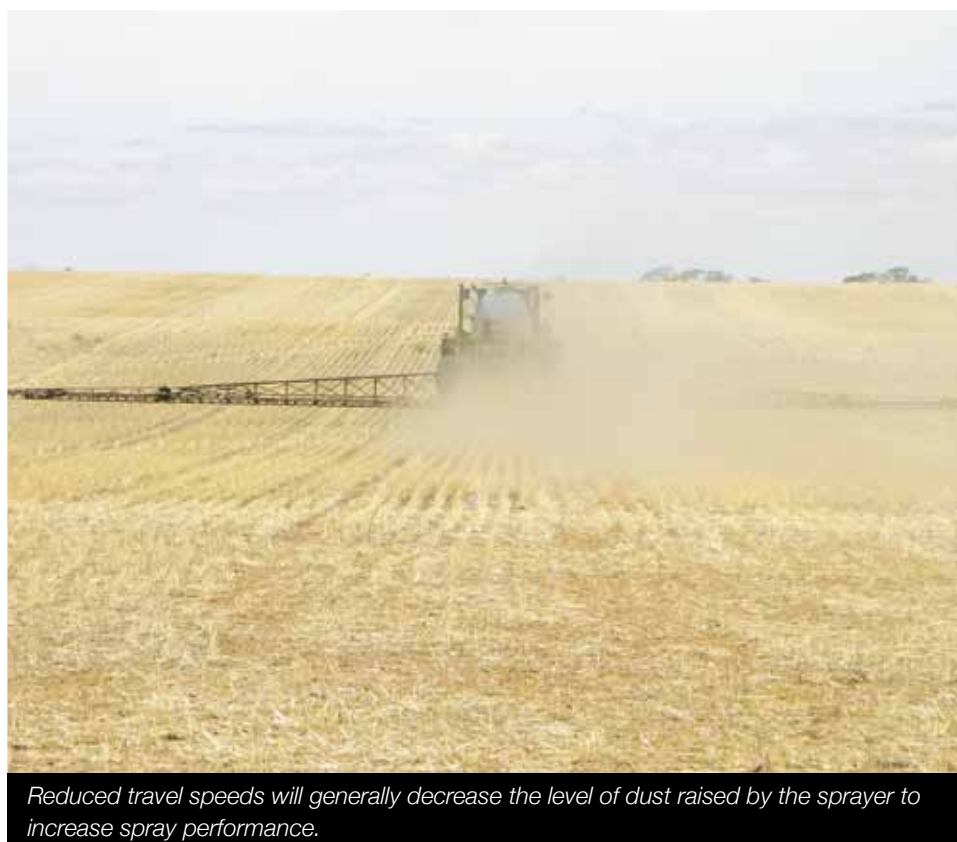
Reduced travel speeds will generally decrease the level of dust raised by the sprayer to increase spray performance.

with many products on the leaf surface (such as glyphosate and paraquat), potentially reducing their efficacy.