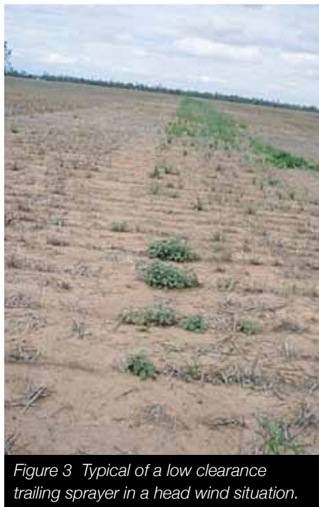
Figure 3 Typical of a low clearance trailing sprayer in a head wind situation.