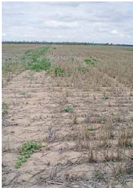
Figure 2 Typical of a higher clearance sprayer in a cross wind situation.

The nozzles directly behind the wheel should still have an increased flow compared to those on the boom. Additional nozzles fitted to either side of the wheel that utilise narrower spacings can be of a smaller orifice size than the other nozzles, provided that the spray quality is reasonably coarse and is at least the same or coarser than that stipulated on the label.