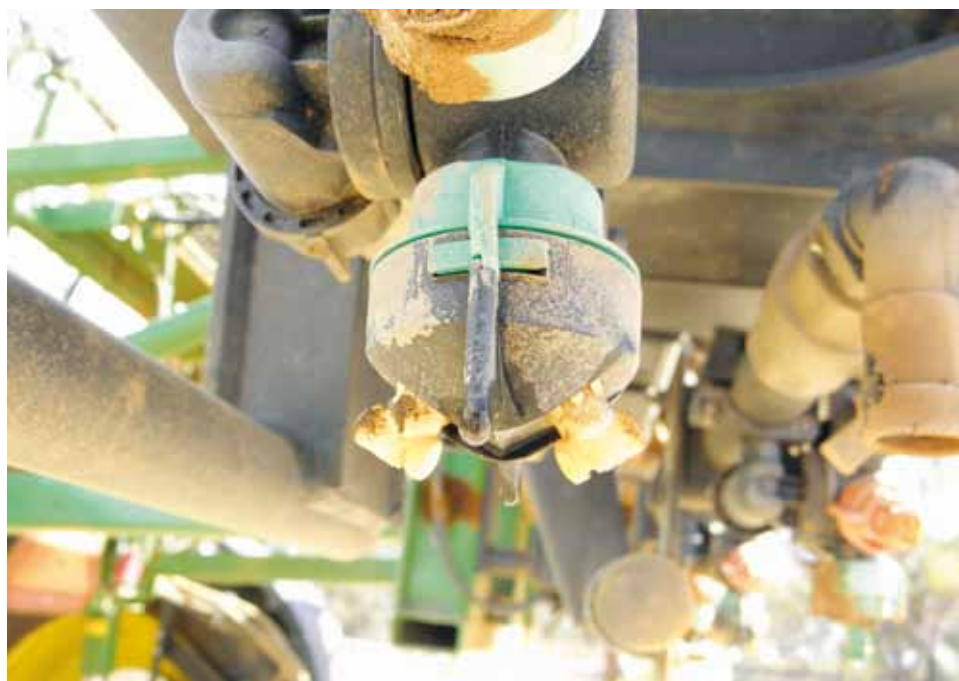
Figure 1 A twin cap wheel track nozzle set up.

If using a 50 centimetre nozzle spacing, it may be worth considering using narrower nozzle spacings (25cm) behind and